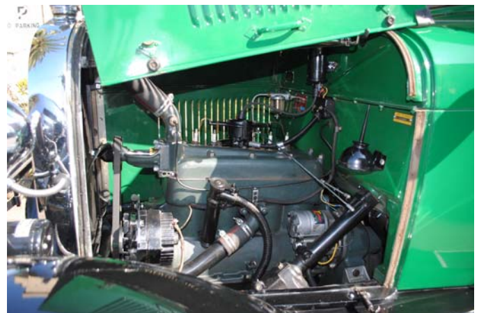
The engine is in good condition now