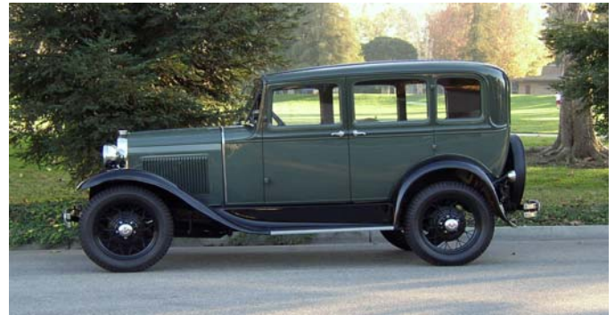
160A Std Sedan exterior

The 1931 Model 160A was the economy standard model and was probably a higher seller back in a troubling economy. The exterior featured no cowl lights, limited body colors, black spoke wheels. No side mounts.