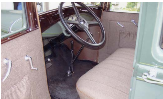
160 A front seating compartment

In 1931 Fords sales were plummeting, Ford was losing about $75 every time it sold a car. Ford tried desperately to cut his losses. He tried styling changes to some models. He decided to introduce more Deluxe models and expand its truck and commercial lines. The 160 A Std interior came with front rubber floor material, no interior sun visor. All window trim was painted a maroon color. There were no arm rests, the upholstery was a check wool and did not have a seat strap for rear passenger lap blankets. The dome light was in the ceiling center.